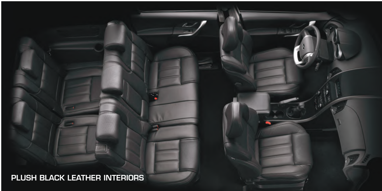
PLUSH BLACK LEATHER INTERIORS