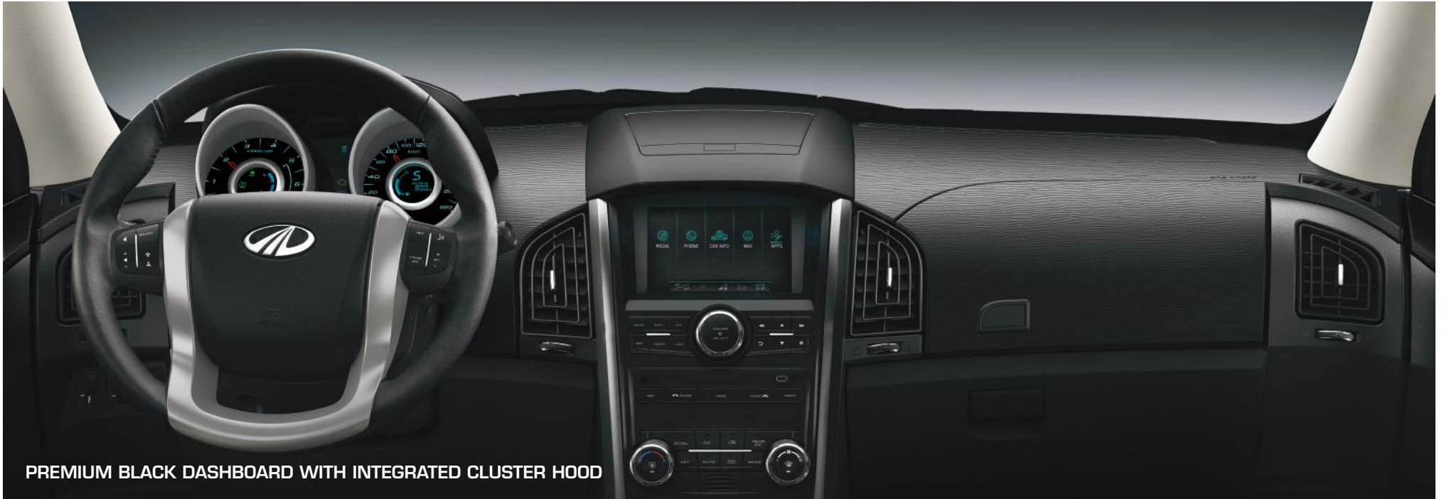
PREMIUM BLACK DASHBOARD WITH INTEGRATED CLUSTER HOOD